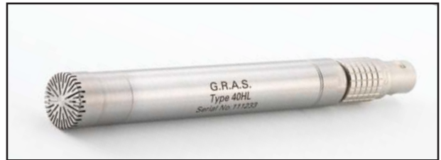
Fig. 1 1/2" Low-noise Microphone System Type 40HL

Type 40HL connects to most high-quality input modules with LEMO 1B connector (optional accessories from G.R.A.S. - refer to the section What to Order ).